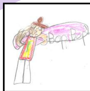
Students were impressed with Riders in the Sky's "mouth music"