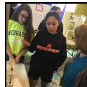
Before the "Future Weather" program, Gering Junior High students presented science fair projects