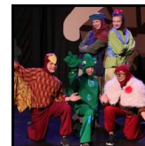
Local students were cast in MCT's production of Snow White