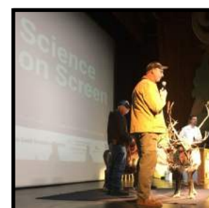
Live reindeer on stage at the "Cowboy" program