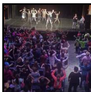
Ballet West dancers led the students in warmup exercises