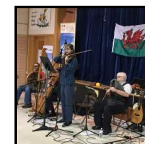
The Welsh Song Fest musicians performed at Longfellow Elementary