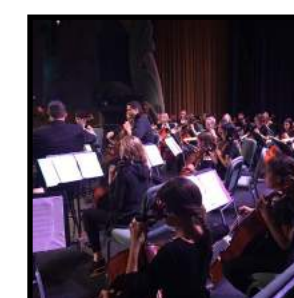
Scottsbluff students played onstage with the Portland Cello Project