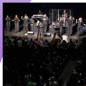
Students joyfully danced as the Harlem Gospel Choir sang "Happy"