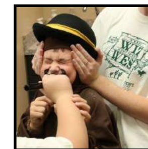
A Wiz of the West actor learned that makeup application can tickle!