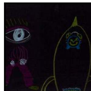
Artwork captured students' impressions of the Moon Mouse show